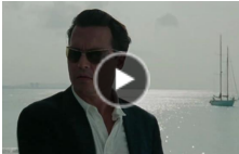
Trailer: 'The Rum Diary' Oct 26, 2011