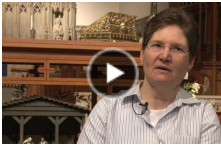
Bill creator prepares for civil union Dec 30, 2011